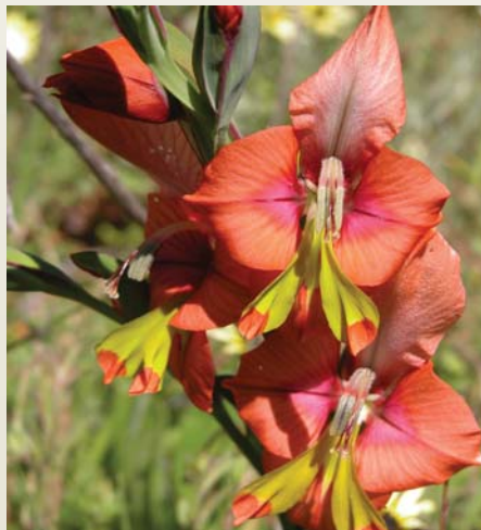
Kalkoentjie (Gladiolus alatus)