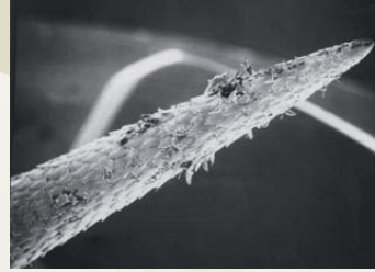
Porcupine quills are sharp as needles with backwards facing barbs that catch on the skin.

Porcupines are mostly vegetarian, using their strong digging claws to get roots, tubers and bulbs. They're also fond of fallen fruits and will sometimes gnaw on